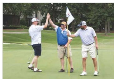
BraveHearts Family Grief Camp. www.methodisthealth.org/golf

Fun day of golf at TPC Southwind featuring breakfast, lunch, and an awards ceremony – Benefitting Methodist Hospice's Camp